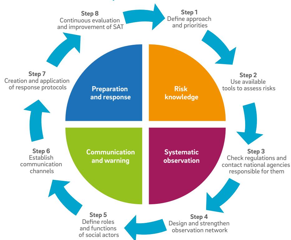
Figure 2. SNAT ideal: elements and steps to follow

Stepped territorialized warning monitoring models are currently being implemented in the country's five main macrowatersheds and rivers, in which monitoring points have been implemented with equipment at hydrometeorological stations, trained personnel from the municipal RMU and the permanent, active involvement of several dozen indigenous communities, who live near the rivers in these basins.